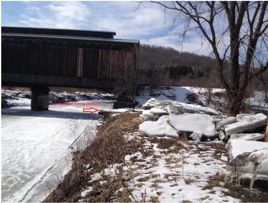
Figure 1. The 10x20 Fisher Bridge fishing platform on the Lamoille River in Wolcott was damaged following heavy February rains and subsequent flooding. Sheets of ice greater than 20 ft. across floated down the river, shearing off the platform's railing. The railing was replaced in June 2016.