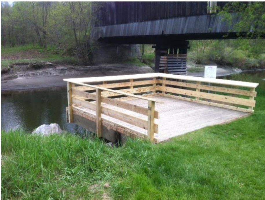
Figure 2. The rebuilt Fisher Bridge fishing platform, June 2016, Wolcott, VT.