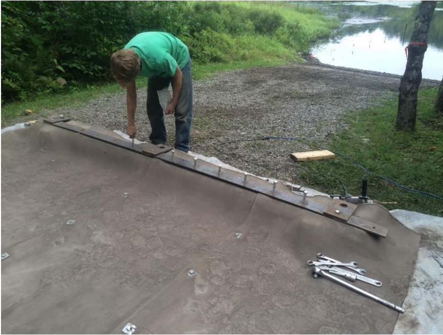
Figure 3. Bolting the 4 ft. strips of concrete cloth together prior to setting it in place at the Dog Pond Access Area in Woodbury, VT.